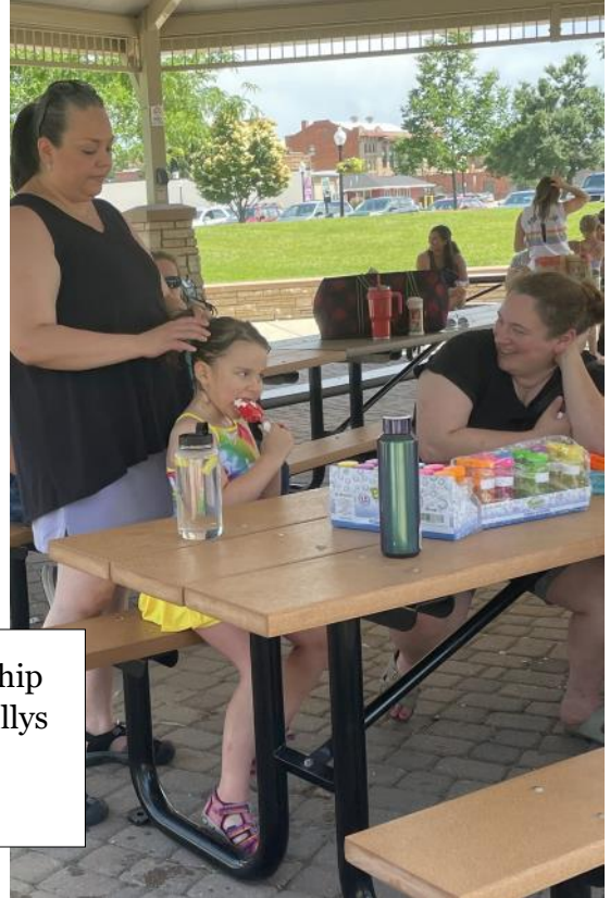
A large group of people enjoyed the Family Fellowship Gathering at Whitney Fountains for Bubbles and Dillys on a warm July Sunday. Dillys were delicious!