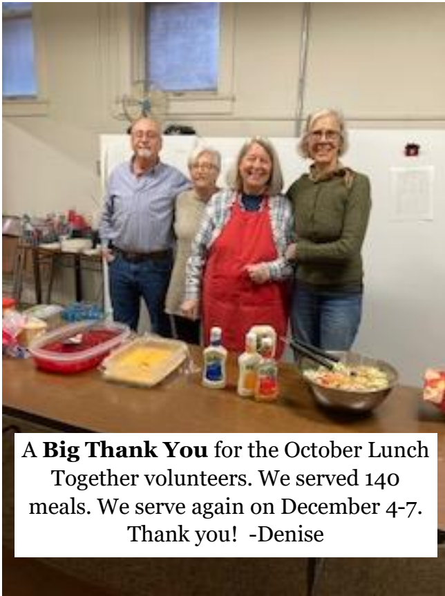
A Big Thank You for the October Lunch Together volunteers. We served 140 meals. We serve again on December 4-7. Thank you! -Denise